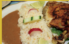
Huevo Ranchero $11.00 Served with rice & beans