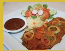
Pollo asado $11.50