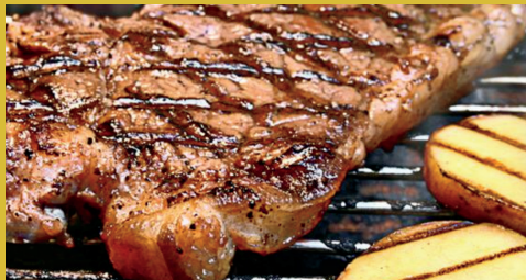
Fritanga con carne $20.00