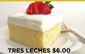
TRES LECHES $6.00