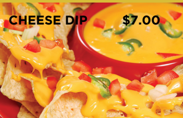
CHEESE DIP $7.00