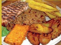
Steak & cheese $10