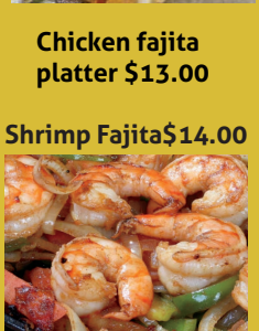
Shrimp Fajita $14.00